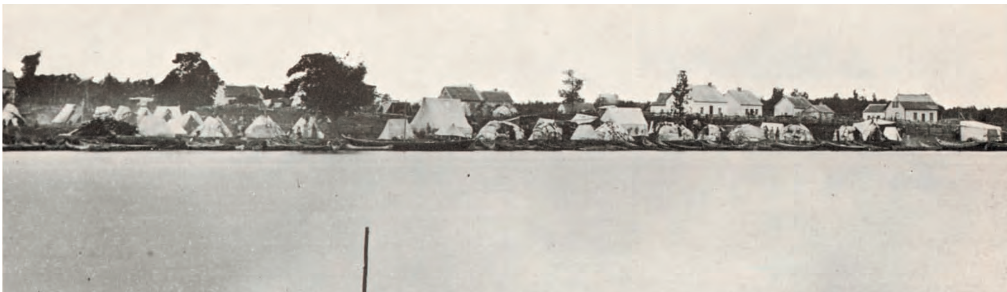
St. Peters, Manitoba, 1880